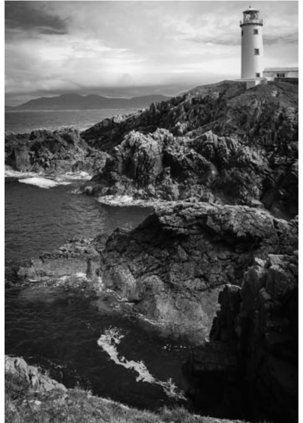
Monochrome Print by Charles Leverett